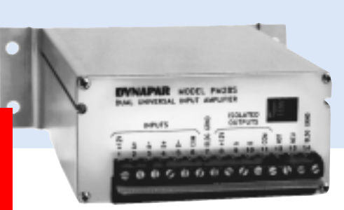
PM28S replaces PM21, PM25 and 101UA

This product is obsolete and information is available for reference only