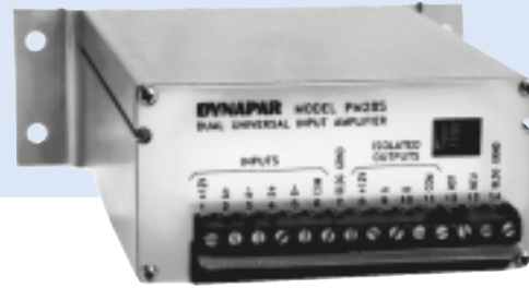
PM28S replaces PM21, PM25 and 101UA

Dual universal input amplifier . . . provides 6 types of input functions