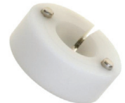
Dual magnet, Nylon collar