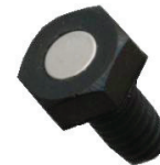
Nylon bolt, 1/4-20