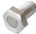
Aluminum bolt, 1/4-20